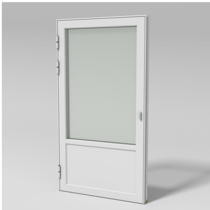
With insulated panel